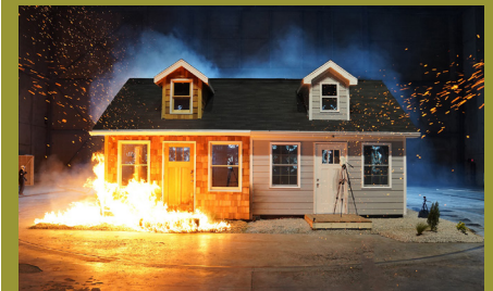
Figure 2b Embers impacting a building: left side with combustible (wood) and the right side with noncombustible (rock) mulch.