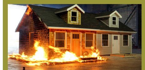
Figure 1 – Creating and maintaining home ignition zones (defensible space) around your property are proven ways to reduce risks of property damage during a wildfire, as tests at the IBHS Research Center have shown.