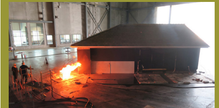
Figure 2a Experiments conducted at the IBHS Research Center to study the effectiveness of creating a noncombustible space around buildings.